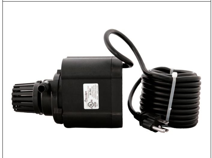
*No gallon reservoir, submerge only.