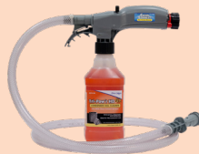
Clean Connect Sprayer P/N: 4773-0