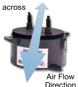
Air Flow Direction