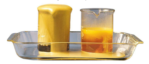
Competitive Product with Dangerous Foam

To demonstrate its capability as a low-foam product, Liquid Scale Dissolver was added to a beaker containing lime scale. A leading competitive hydrochloric acid based product was added to another beaker containing an equal amount of lime scale. The difference is dramatic. When cleaning towers and evap condensers, low-foam is the preferred approach as high foam is both dangerous to personnel and surroundings and it represents wasted acid.