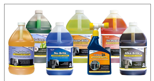
CONDENSER COIL CLEANERS

In addition, clogged and dirty permanent filters restrict air flow and do not filter air, allowing dirt to contaminate rooms and stain walls around air ducts. Lastly, dirty electronic air cleaners, fouled with pollen, nicotine and other pollutants prevent them from adequately cleaning the air. Regular cleaning with Nu-Calgon products protects equipment and helps maintain peak operating efficiency.