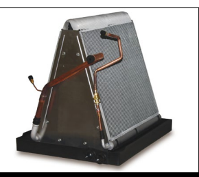
Indoor Coil - Microchannel (All Aluminum) Construction