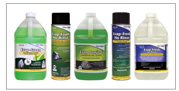
EVAPORATOR COIL CLEANERS