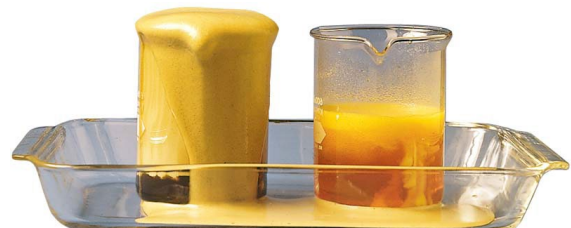
Competitive Product with Dangerous Foam

To demonstrate its capability as a low-foam product, Liquid Scale Dissolver was added to a beaker containing lime scale. A leading competitive hydrochloric acid based product was added to another beaker containing an equal amount of lime scale. The difference is dramatic. When cleaning towers and evap condensers, low-foam is the preferred approach as high foam is both dangerous to personnel and surroundings and it represents wasted acid.