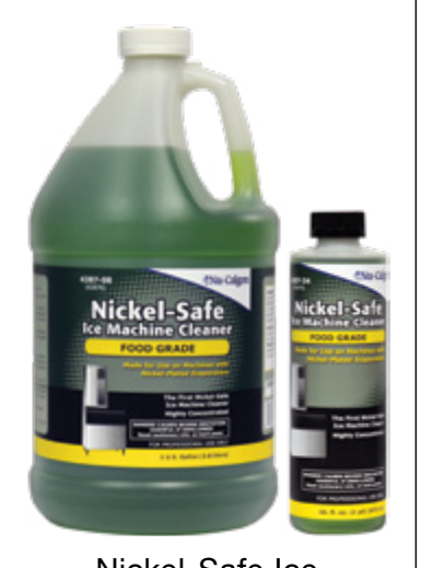
Nickel-Safe Ice Machine Cleaner

As the scale begins to form, it creates a physical obstruction that results in: plugged distribution holes, restricted water flow and eventually the ice maker will hang-up or jam. Ice harvest is reduced and eventually the machine will shut down.